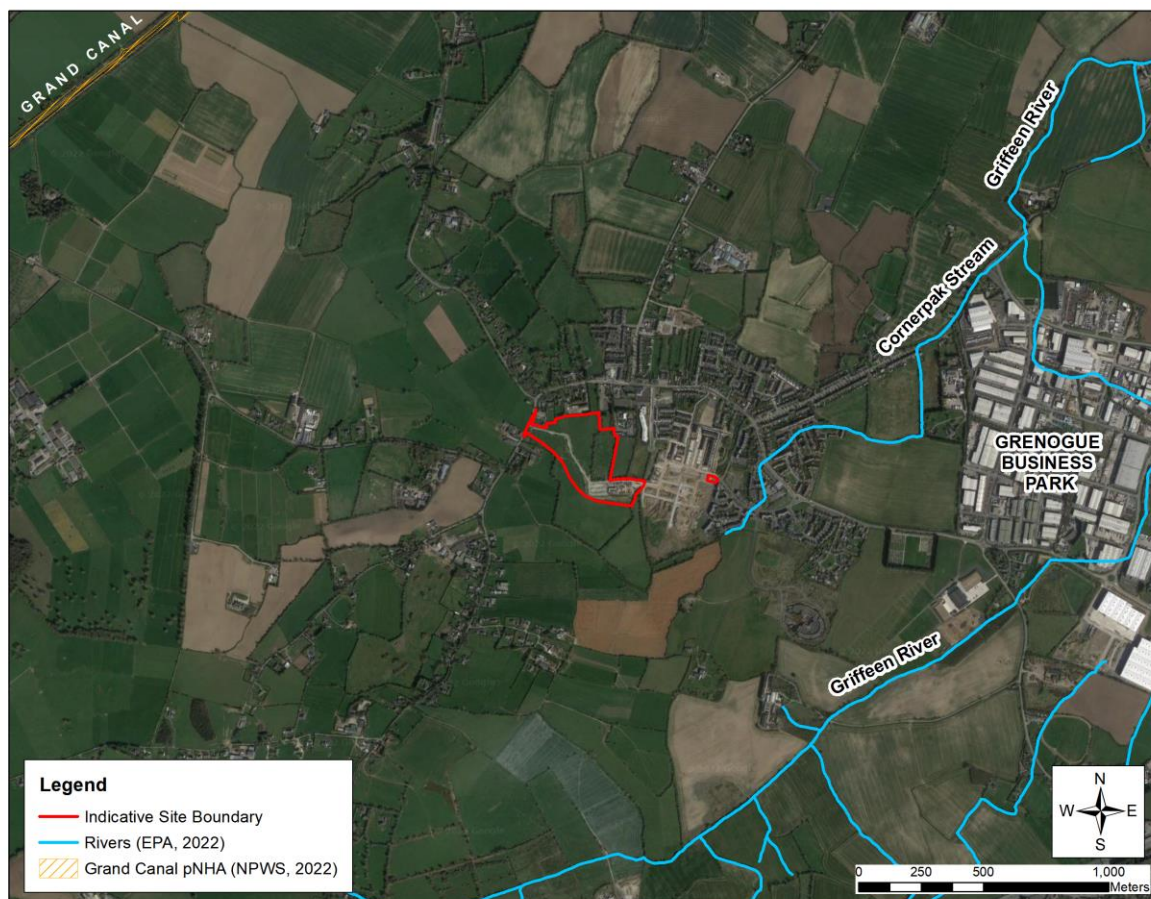
Figure 1.1 Site Location in relation to local drainage

The Griffeen River discharges into the River Liffey c. 7.4Km to the north of the site which finally outfalls into the South Dublin Bay SPA/SAC/pNHA which is c. 20km to the east of the site. There would be an indirect discharge to Dublin Bay waterbody from the Proposed Development site through the stormwater and foul water site drainage as described in Section 1.3 below.